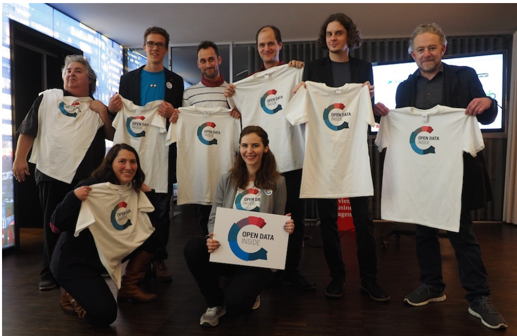
The first Open Data Ambassadors celebrate the project's launch in Vienna.

The Open Data Inside badge distinguishes all those who use open data for their applications, services and/or work towards spreading awareness for open data: sole proprietors, companies, private and state organisations, associations, NGOs/NPOs, institutions and academic institutions as well as bloggers, data-driven journalists, programmers, and many more.